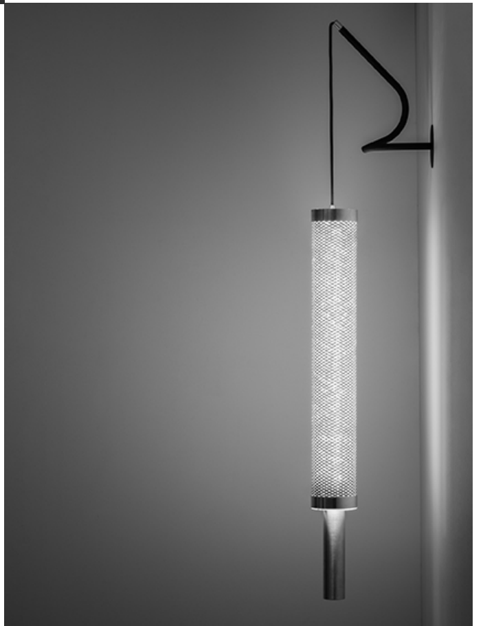
Miralles Tagliabue EMBT