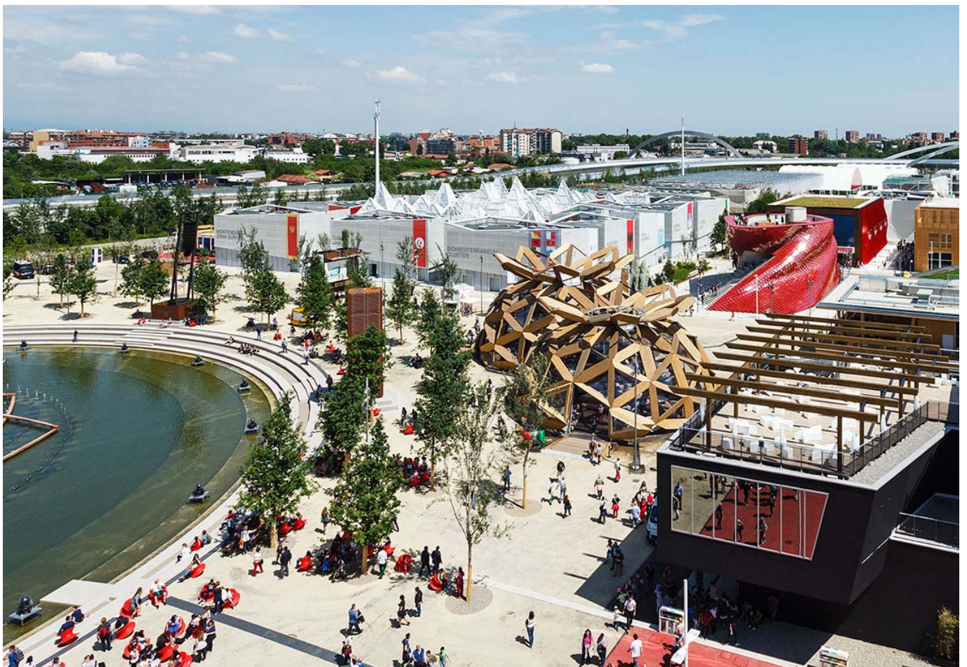
Miralles Tagliabue EMBT