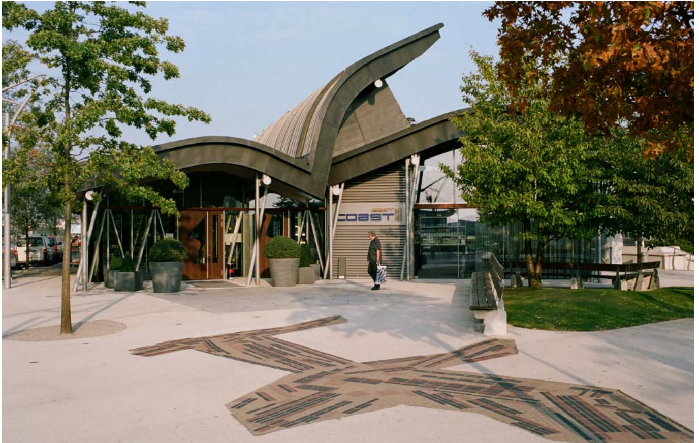
'East Coast' Restaurant Hamburg, Germany