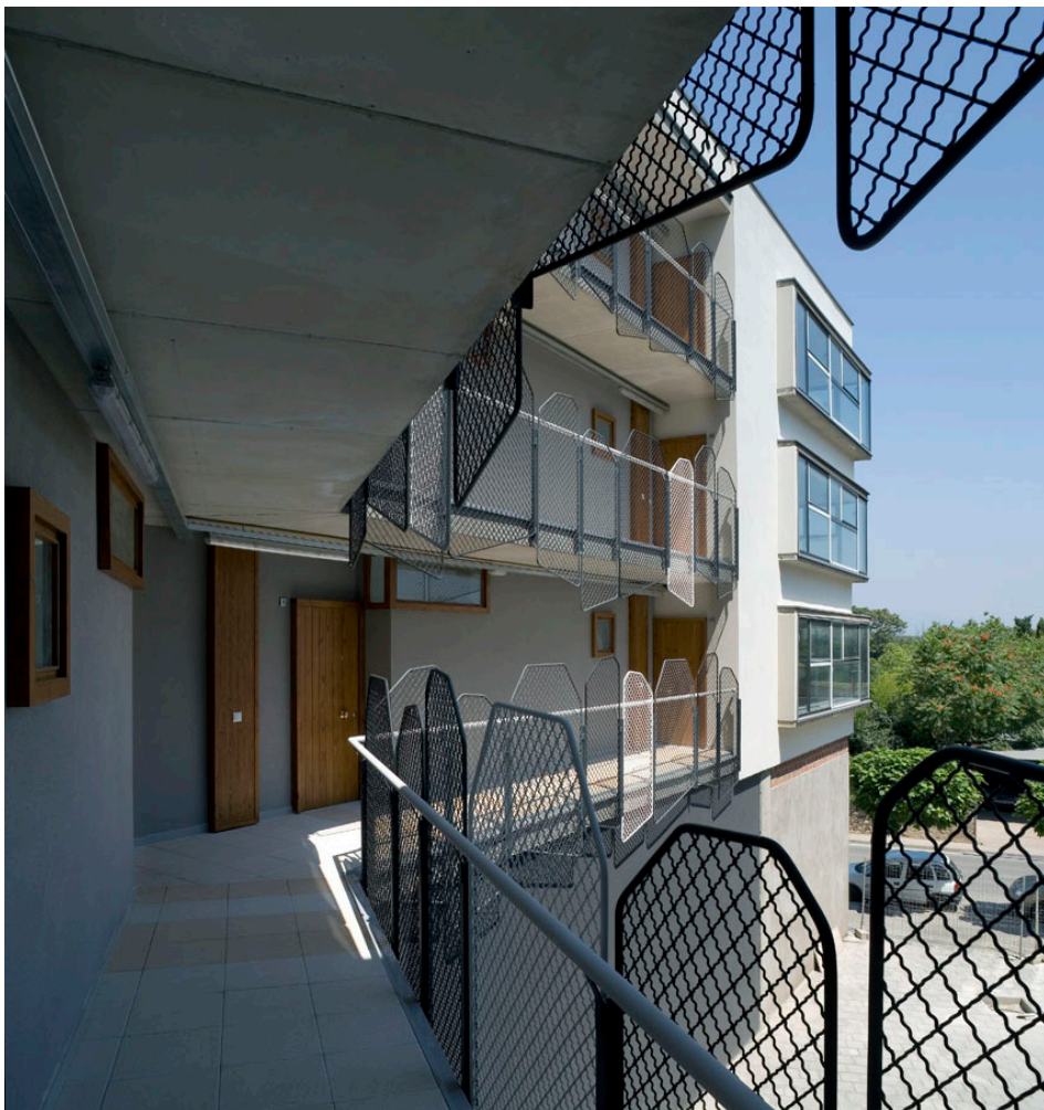
Miralles Tagliabue EMBT