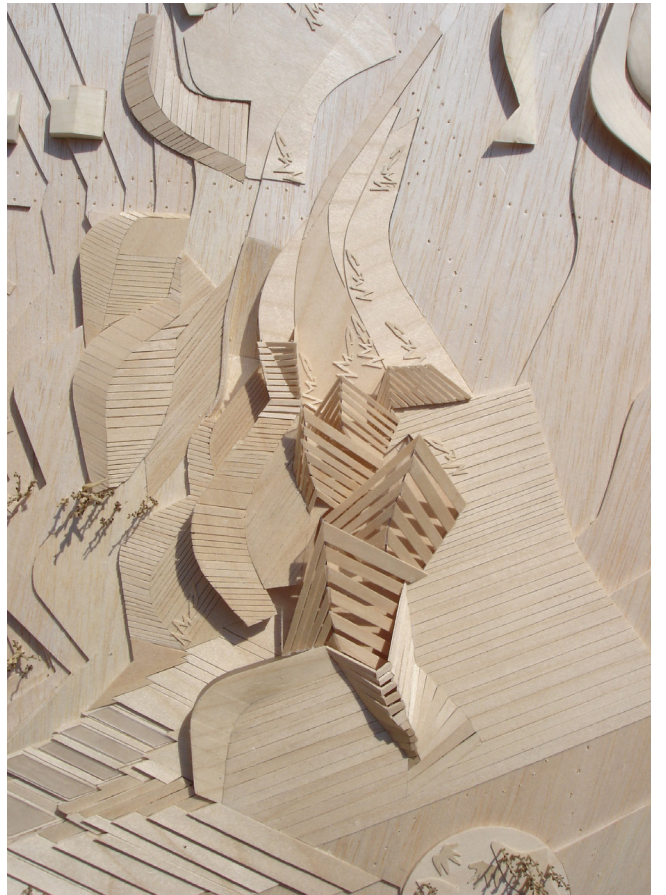
Miralles Tagliabue EMBT