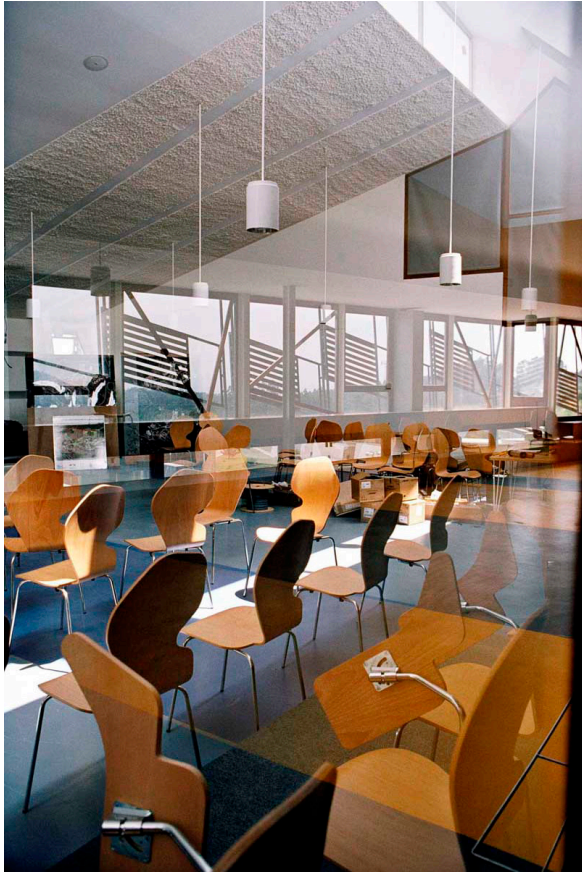
Miralles Tagliabue EMBT