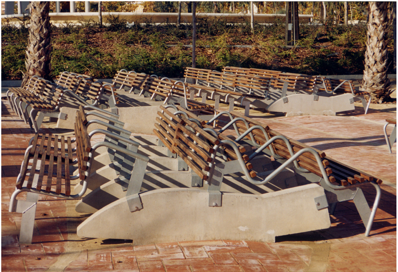
Miralles Tagliabue EMBT